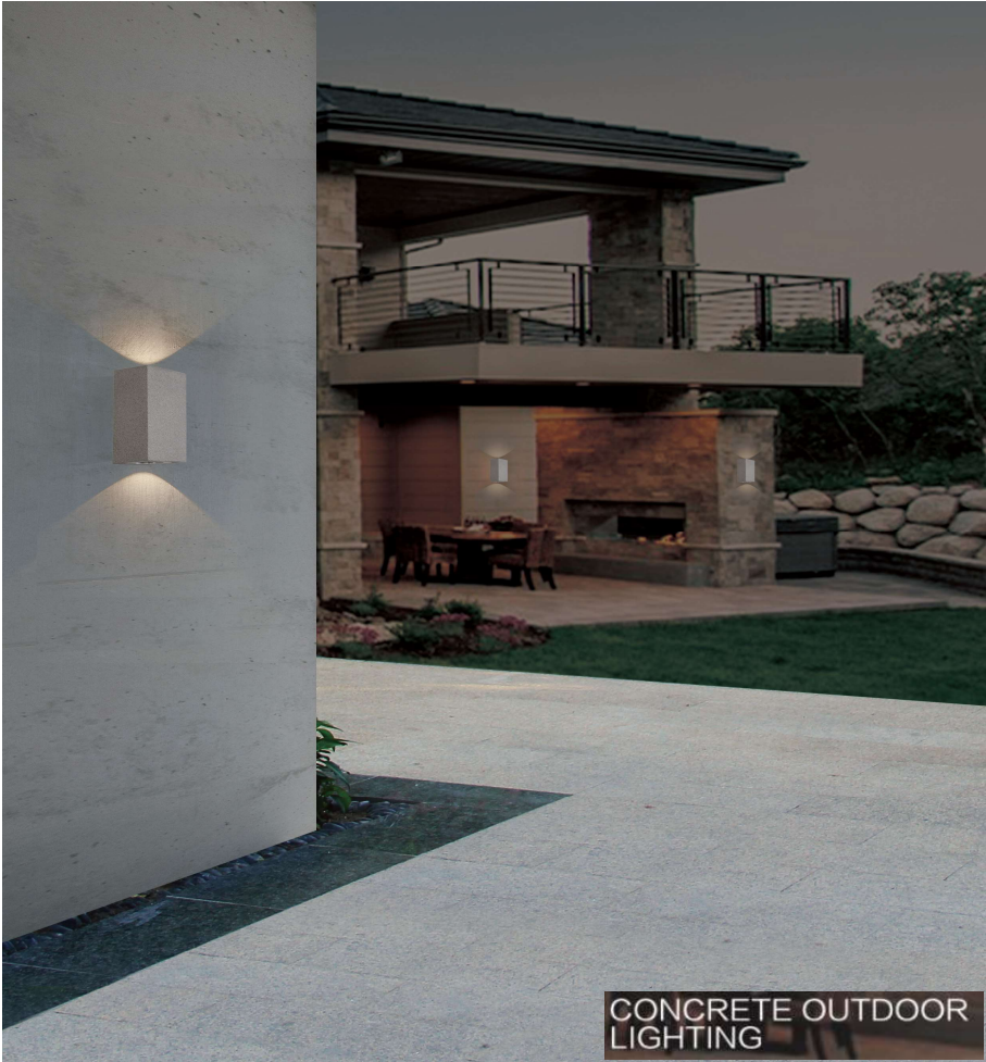
CONCRETE OUTDOOR LIGHTING