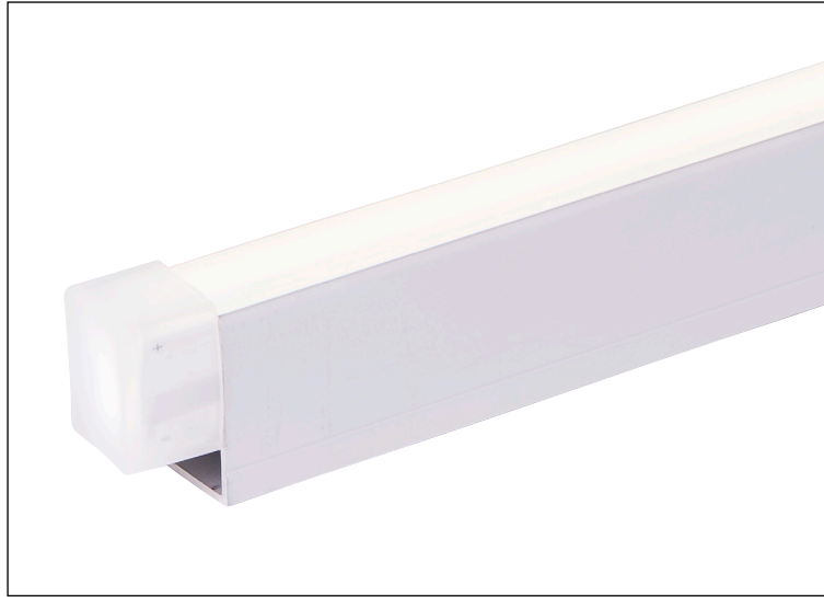
Shown with Aluminium Channel