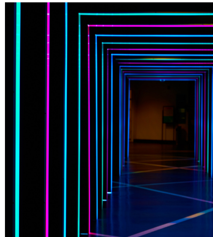
*Representation of a dotless COB strip in a LED profile