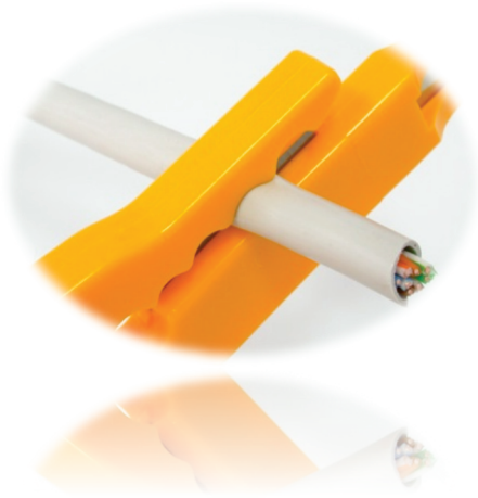
Cable Stripping Action