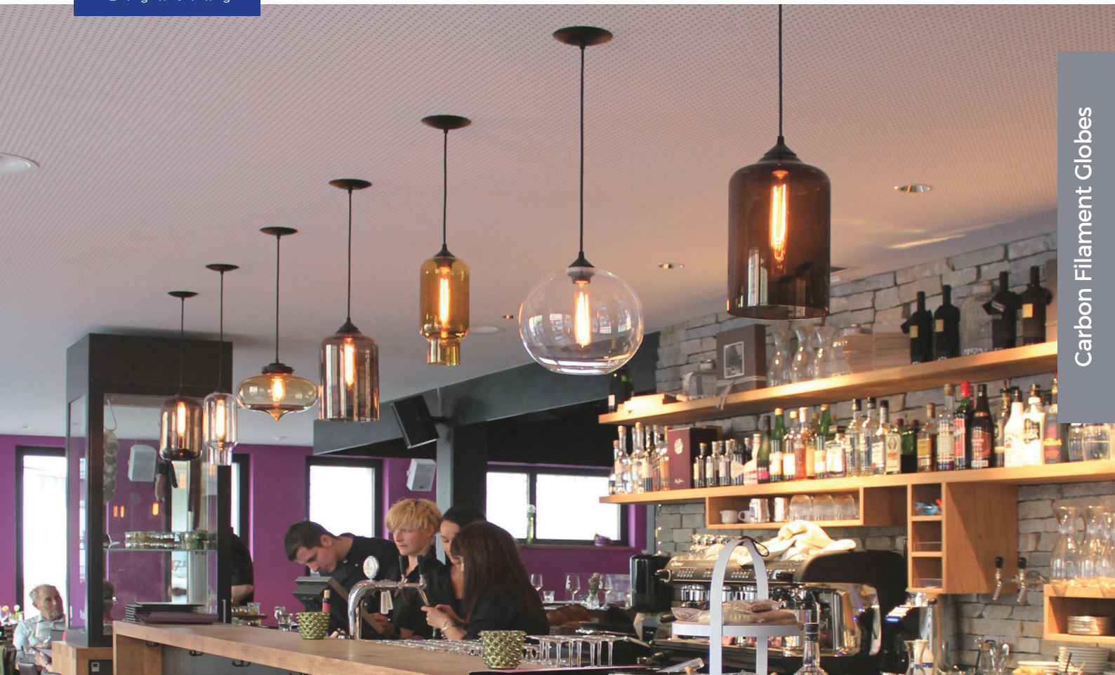
Carbon Filament Globes